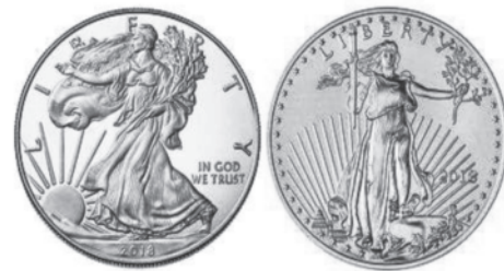
2018 Silver and Gold Eagles are in, all are Gem BU straight out of fresh mint sealed boxes.